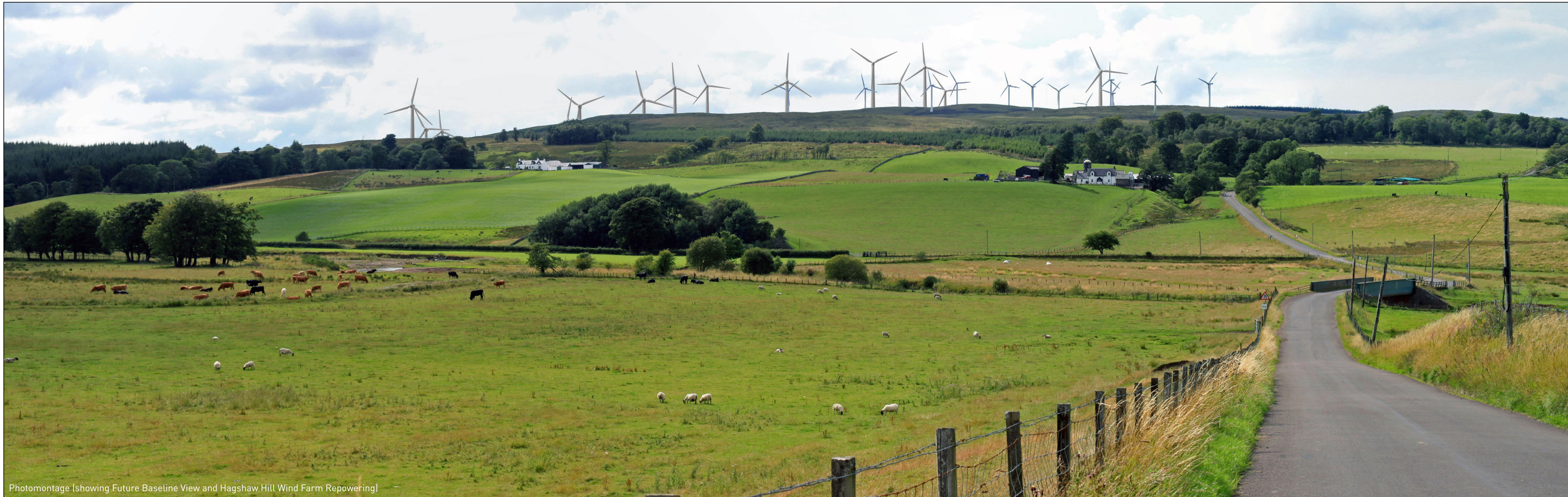
Photomontage (showing Future Baseline View and Hagshaw Hill Wind Farm Repowering)