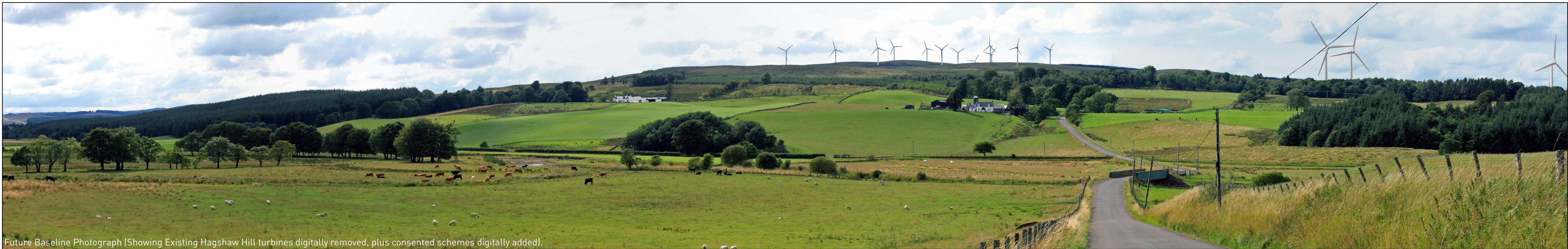
Future Baseline Photograph (Showing Existing Hagshaw Hill turbines digitally removed, plus consented schemes digitally added).